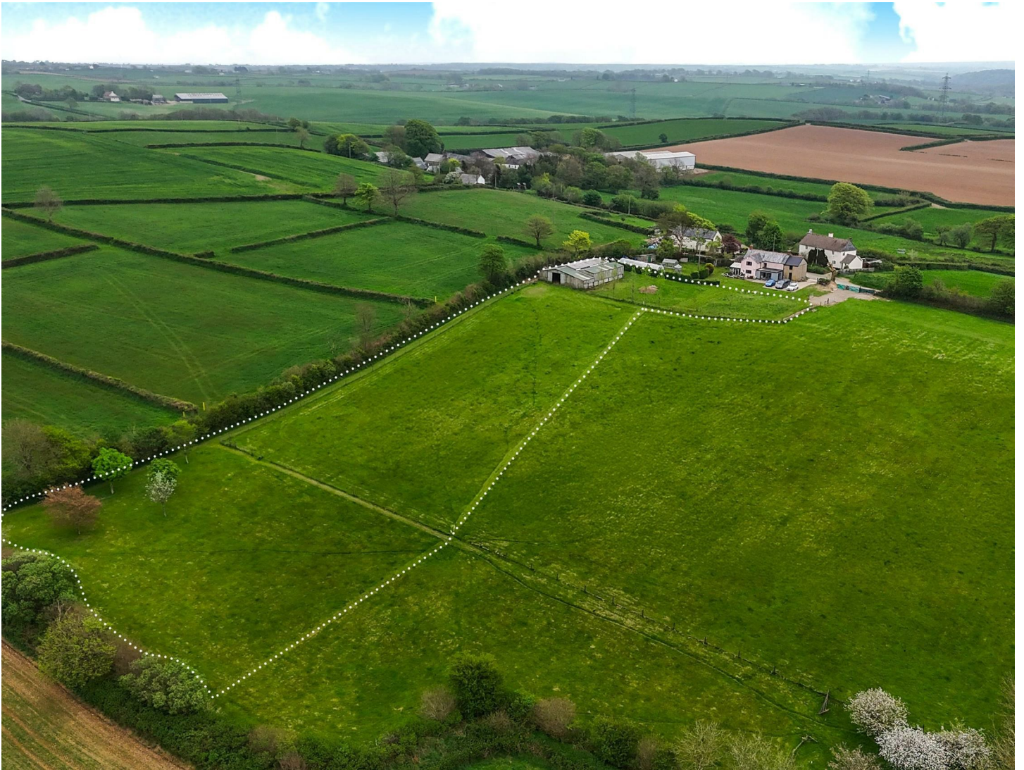
COMMS Barn in Bulkworthy